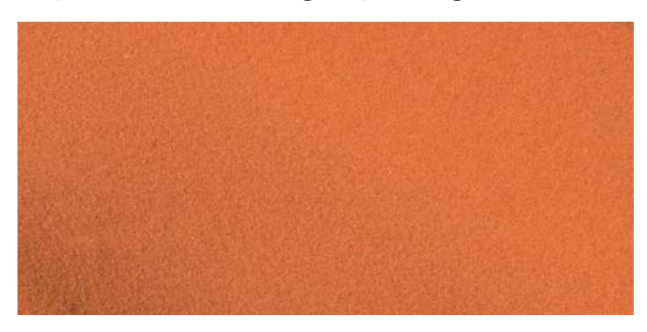
Compiled by Bob Spalding

Texture is a quality of structure rather than tone or color, and it appeals principally to the sense of touch. More than a visual element, it is physical sensation and memory. In a photograph, a sense of texture makes our eyes believe that a rusted metal surface feels rough to the touch, or that a polished steel surface is indeed smooth and glasslike.