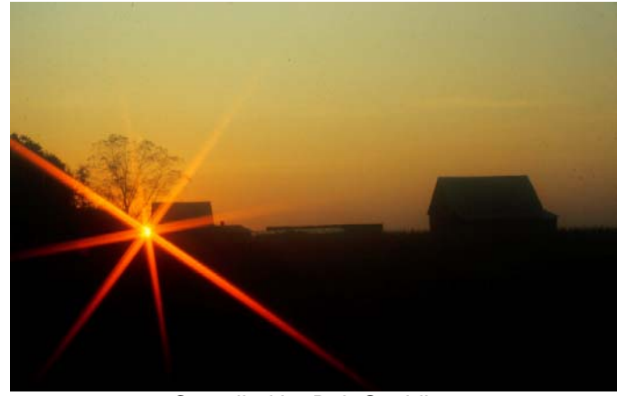
Compiled by Bob Spalding

One of the most overlooked aids in composition is that of color. By using color creatively, the photographer can lead the viewer's eye to the subject. Color can set the mood of the photograph. Specific colors draw our eyes too. Red and yellow are dominate colors whereas blues and greens are warm colors.